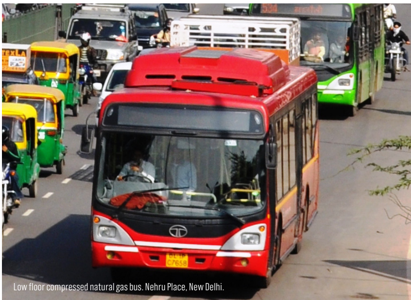
Low floor compressed natural gas bus. Nehru Place, New Delhi.